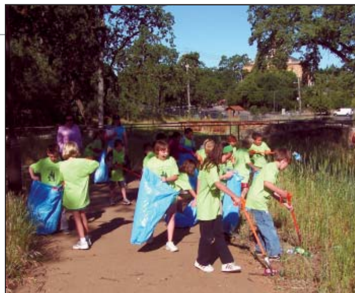
Students participated in Healthy Auburn Waters 2008 event by picking up recyclables and trash in Auburn's School Park.

Walkability —a new buzzword when looking at a city's sustainability—is hot on the